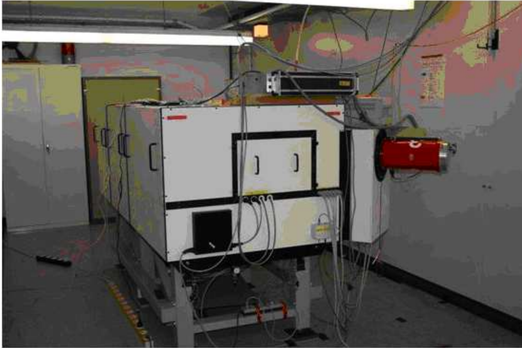
Figure 1: An external view of FOCES, the current high-resolution spectrograph of the 2.2m, that is intended to be copied. In the view, it is visible the input of the two fibers, the external cover that isolate the optical table, and the external CCD.